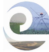
Franklin Conservation District

A $40 non-refundable deposit is due with the registration and the remaining $60 registration fee will be paid through a scholarship. This is available for the first 20 teachers to register by 4/30/10. You will receive lunches, snacks and tons of classroom materials. Classes are taught by resource professionals using hands-on, grade-appropriate lessons that you can use to teach your students about natural resource management. Credit: Earn 17 ESD 123 clock hours. Clock hour fees are separate and the responsibility of the registrant.